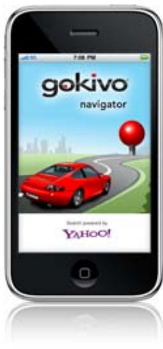
iPhone: Recognized brand in application stores