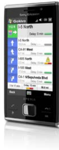
Sony Ericsson: View upcoming maneuvers with traffic details.